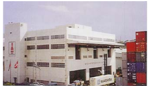
Headquarter Office in Hong Kong 位於香港的栢堅總公司