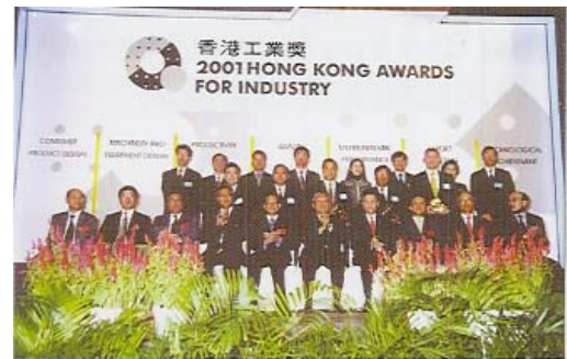
The celebration ceremony of 2001 Hong Kong Awards For Industry 二零零一年香港工業獎頒獎禮